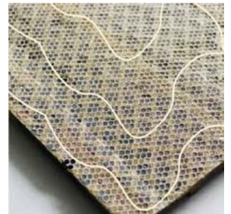
Polyurethane glue on back of tile

Start first panel at the bottom left corner of the wall working to the right.